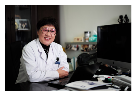
path of dream realization. We are full of confidence to live up to the expectations and make our dream come true in September 2019 with an unparalleled success.

To host a WFNS meeting in China has become a dream. Our bidding for a WFNS interim meeting won the voting of WFNS Executive Committee and the delegates from member societies at the WFNS2015 Rome interim meeting. The WFNS constitution was revised at the WFNS2017 Congress in Istanbul from every 4 years a congress to every 2 years, discontinuing the "interim meeting". 2019 WFNS Special World Congress has thus become a vital turning point in WFNS history. It is the last WFNS interim meeting and the first congress under its new constitution. We know this is a heavy task WFNS Executive committee has bestowed on us at a crucial moment of succession of the new to the old. It is not only a recognition of the development of Chinese neurosurgery but also a trust placed on the Chinese neurosurgeons. We have embarked on the